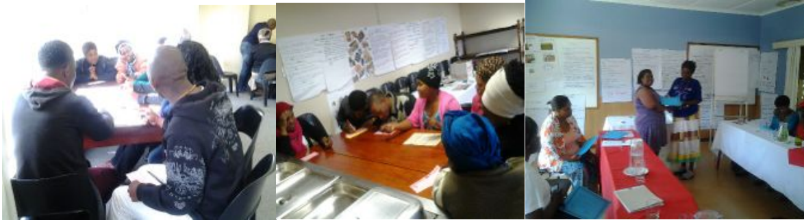
Caregivers attending TB Training at Vuleka Centre & Swaziland Catholic Centre [August & September 2014]