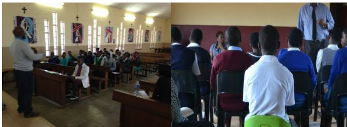
Learners attending Career workshops at Ikhaya and Good Shepherd [August 2014]

“Thank you for the opportunity of this career day and thank you to Sizumndeni organisation for organising such an informative and motivating event.” – Sizumndeni care Centre