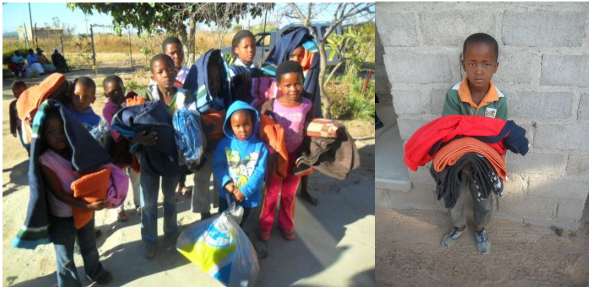
Children with their winter hampers [Polokwane, July 2014]

910 MVC from 525 households benefited from the winter blankets project. Blankets; towels and tracksuits were distributed to children at Christ the King (150 children benefited); Good Shepherd (97 children benefited); Sithembele (150 children benefited); Polokwane Diocese (150 children benefited); Sizumndeni (250 children benefited) and Siyabathanda (60 children benefited).