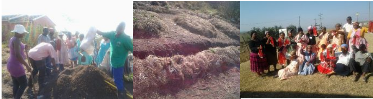
Lima, Food Gardens Training – Sizumndeni