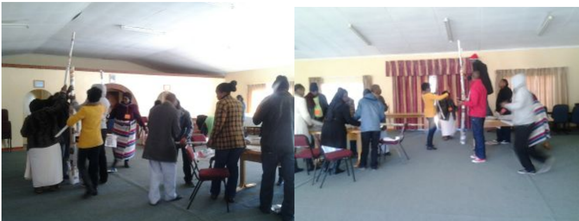
Project management participants during a planning exercise [Lumko, July 2014]

From the project plans submitted, 3 sites (Sithembele; Siyabathanda and Sizumndeni) needed more mentoring and support from the plans that they submitted and it was arranged that RDSP would visit these sites individually and work with their respective management teams.