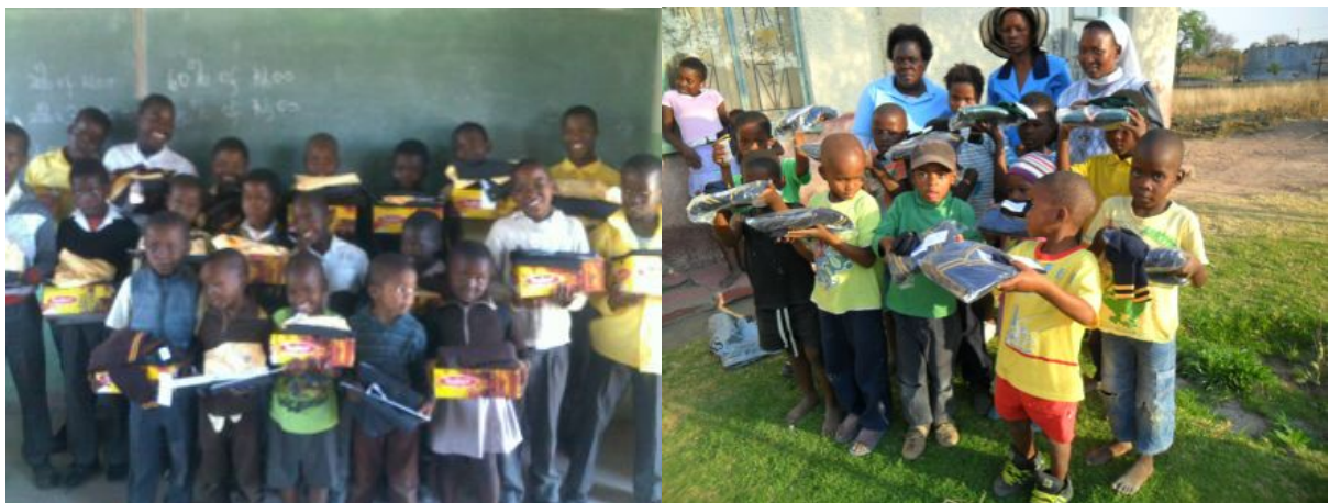
Learners holding their new uniforms at Mahlaya Primary School (Sizumndeni) and Polokwane diocese