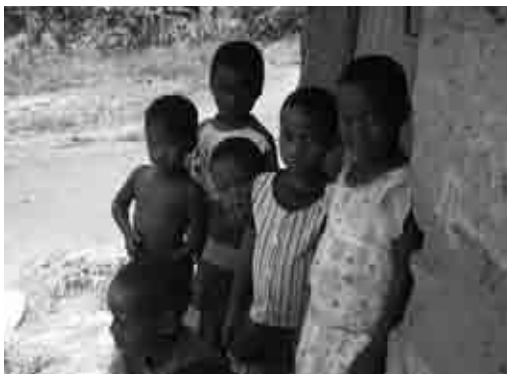
Children at Hlabisa

Staff and volunteers in these programmes recognise the necessity of forming an active partnership with the children whose lives are so deeply affected by HIV. They refuse to treat the children as passive objects of bureaucratic mechanisms or