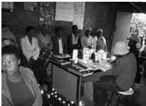
Staff and visitors at Botshabelo