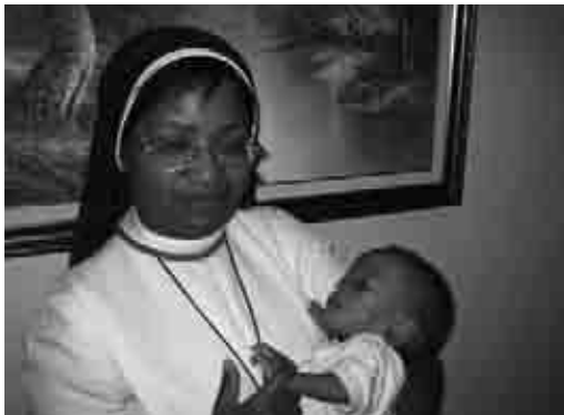
Infant in Care Nazareth House

Finally, the Faith in Action Report posed some important questions and challenges, such as the following.